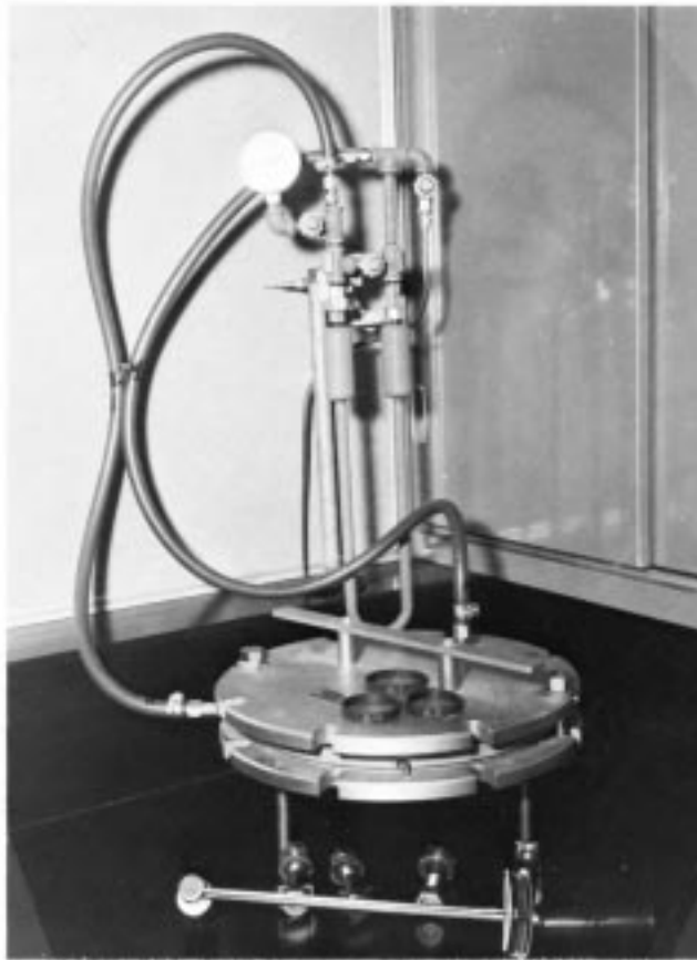
FIG. 1 Suggested Pressure-Membrane Apparatus

of other materials also may be used or undisturbed samples may be retained in sections of their sampler liners. The rings are numbered in pairs; for example, A1, A'1, A2, A'2, etc.