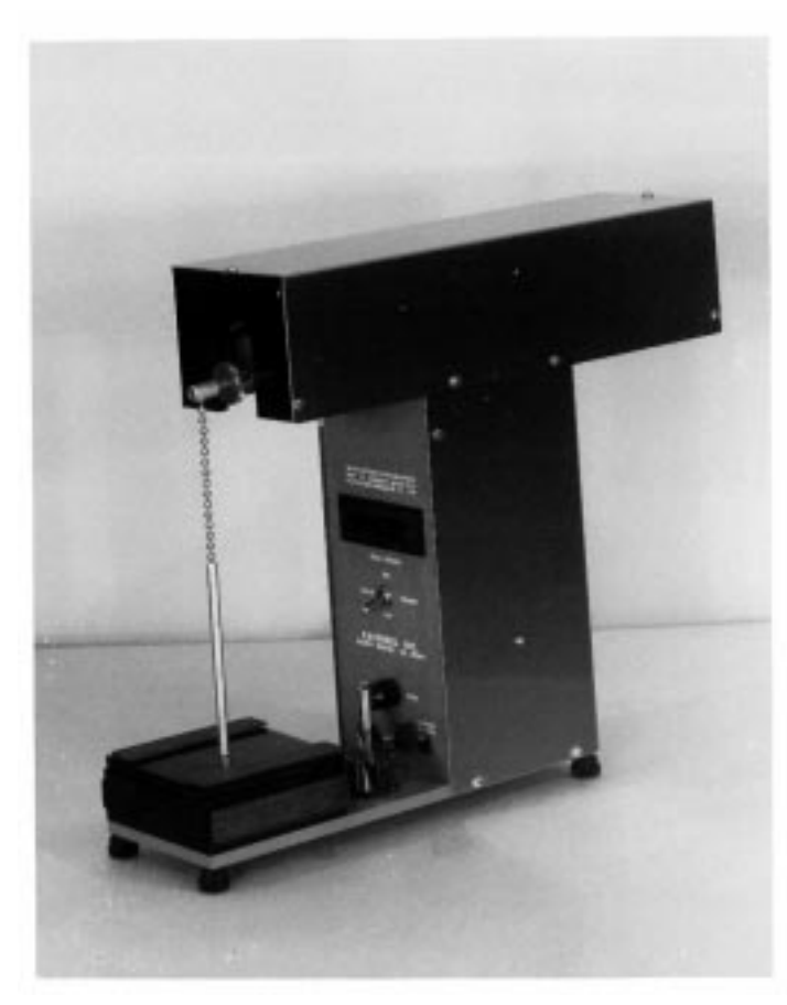
FIG. 2 Electro-Mechanical Device

the film. Five specimens shall be tested. If the test specimens are taken from a roll, care should be taken that the roll is in good condition. The specimens should be taken at least 25 mm below the outer surface of film rolls.