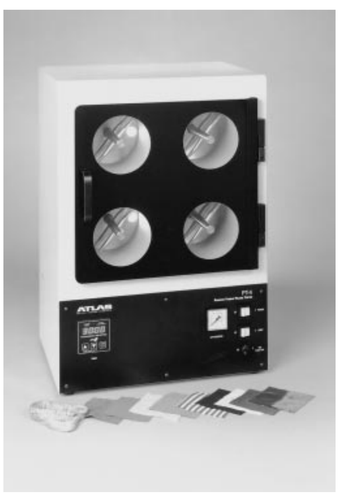
FIG. 1 Random Tumble Piling Tester